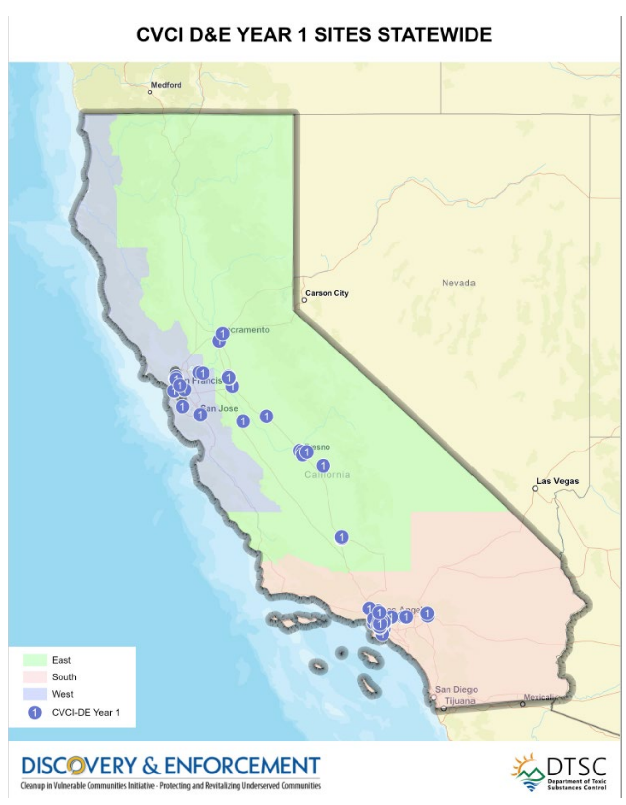
Figure 3 Graphic prepared by DTSC's Discovery and Enforcement Program. Interactive map can be found here: <a href="https://dtsc.ca.gov/discovery-and-enforcement/">https://dtsc.ca.gov/discovery-and-enforcement/</a>